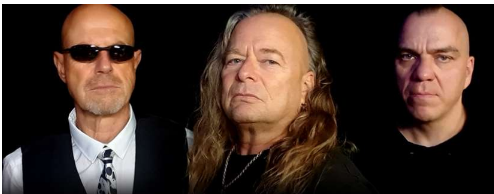
© Big Bone by Mik Clavet

A power trio from Nyon, influenced by the subtle melodies of excavators and steam rollers. Vocals, bass and drums, a simple and straightforward fresco, a raw music - Big Bone is Stoner Rock or even Gasoline Rock!